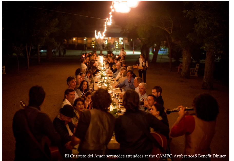
El Cuarteto del Amor serenades attendees at the CAMPO Artfest 2018 Benefit Dinner