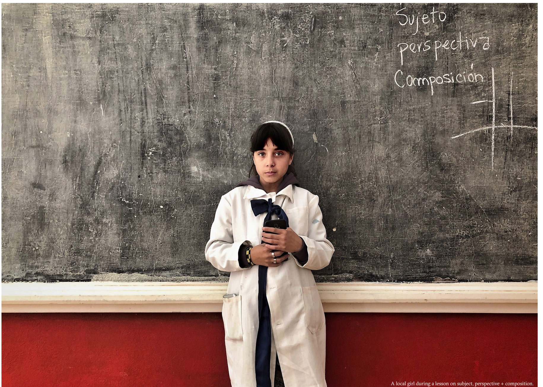
A local girl during a lesson on subject, perspective + composition.