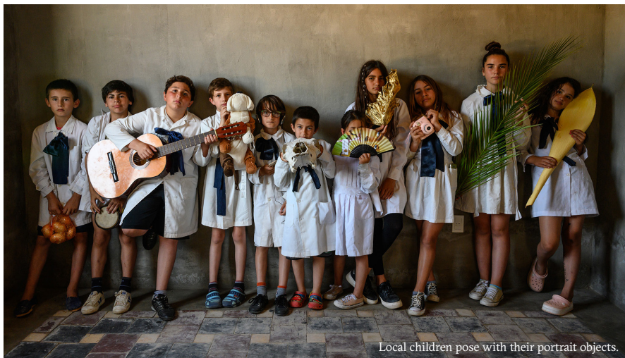
Local children pose with their portrait objects.