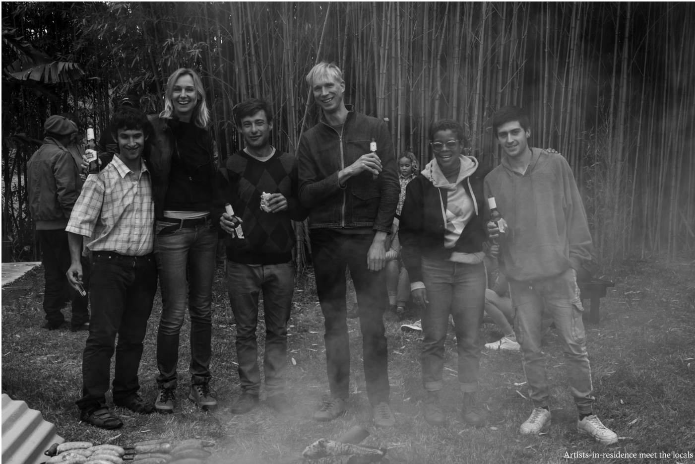
Artists-in-residence meet the locals

“What are you going to do?” I asked her. “Take photographs, I suppose.”