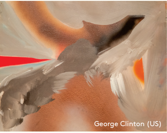
George Clinton (US)