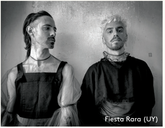
Fiesta Rara (UY)