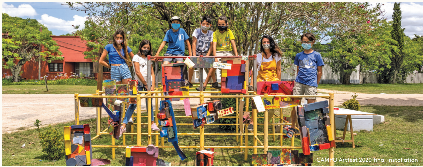
CAMPO Artfest 2020 final installation