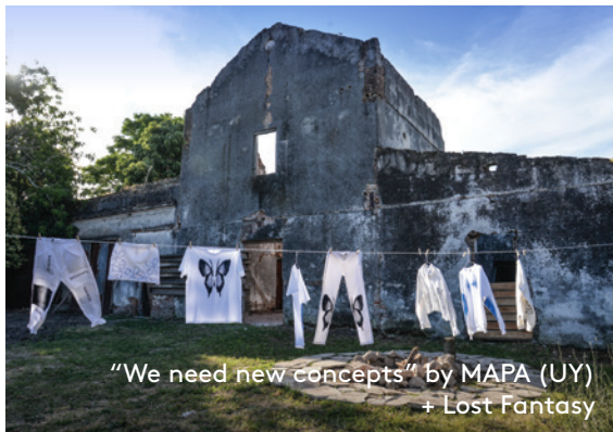
“We need new concepts” by MAPA (UY) + Lost Fantasy