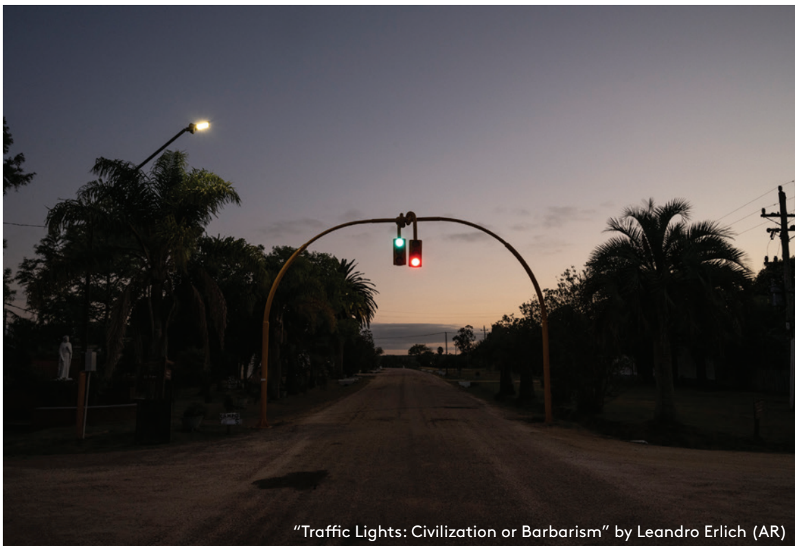
“Traffic Lights: Civilization or Barbarism” by Leandro Erlich (AR)