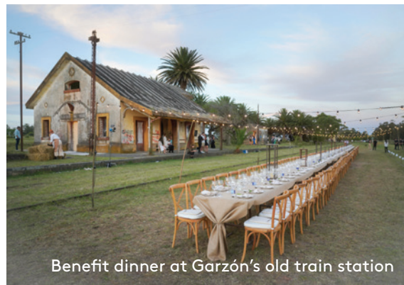
Benefit dinner at Garzón’s old train station