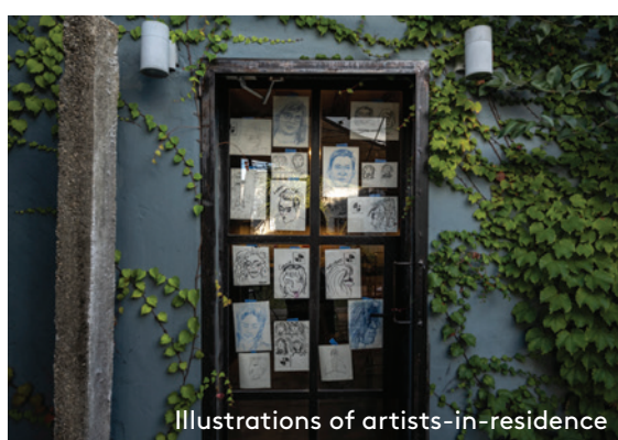
Illustrations of artists-in-residence