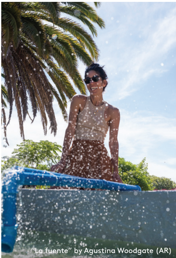
“La fuente” by Agustina Woodgate (AR)