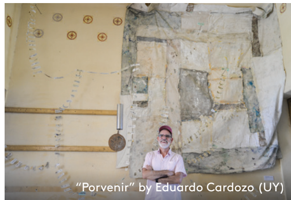
“Porvenir” by Eduardo Cardozo (UY)

artists, including 20 from Uruguay, four artists-in-residence and five who traveled from Buenos Aires, to make works inspired by the theme ON PROGRESS: reflections on moving forward . For two days, the pueblo pumped with art and conversation, foreign and local visitors, who meandered through the streets, old ruins, and the train station full of thoughtful and provoking creations. ■