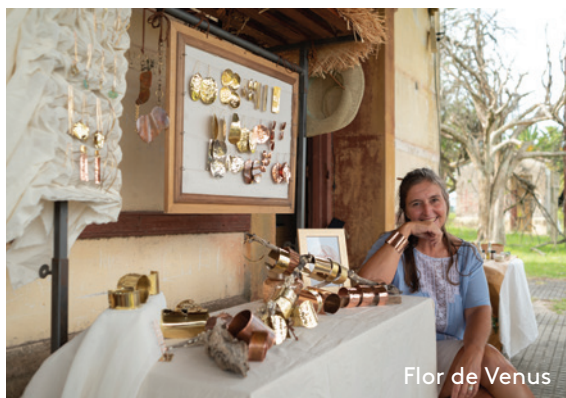
Flor de Venus