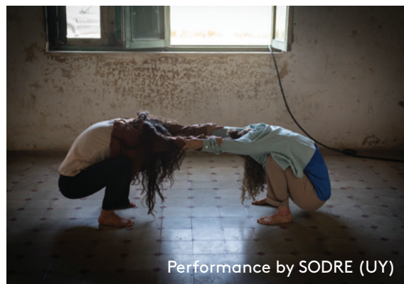
Performance by SODRE (UY)